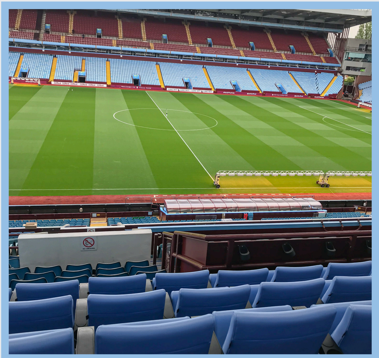
View from seat