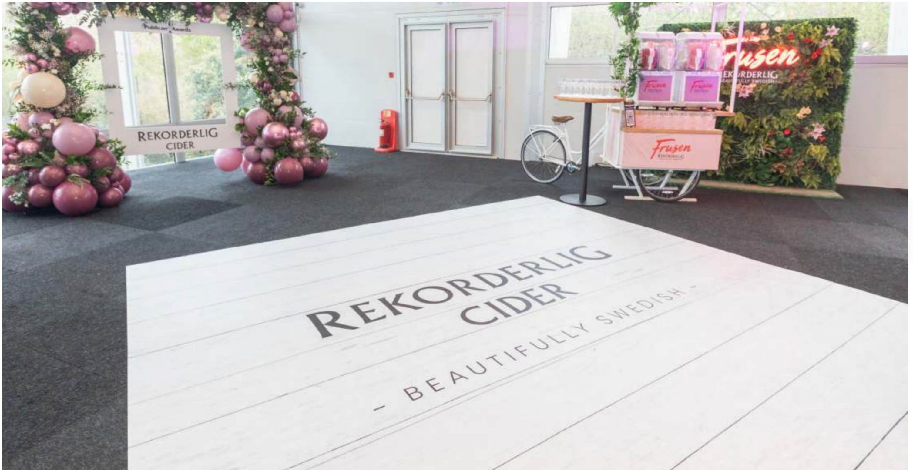
Mezzanine, Evolution London