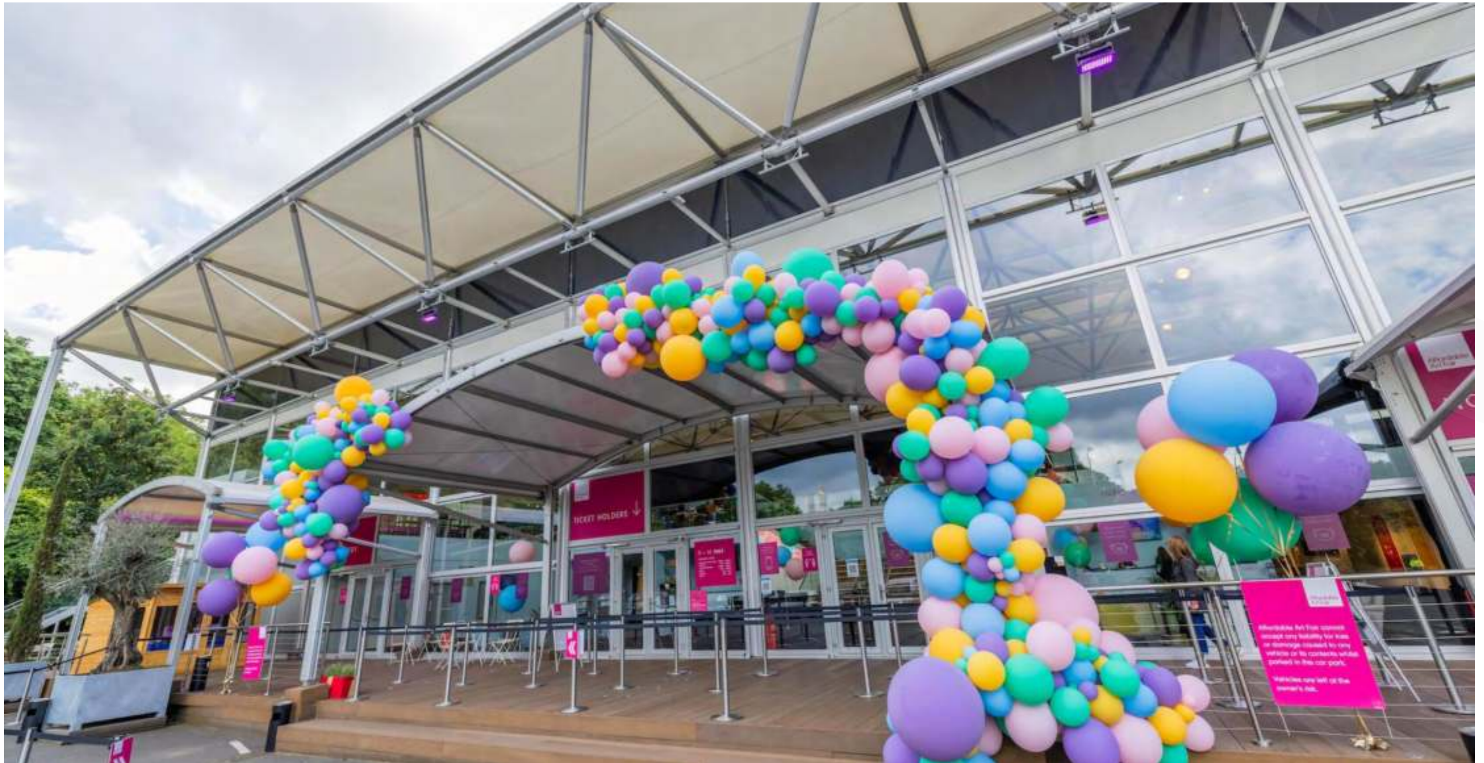
Evolution London, Battersea Park