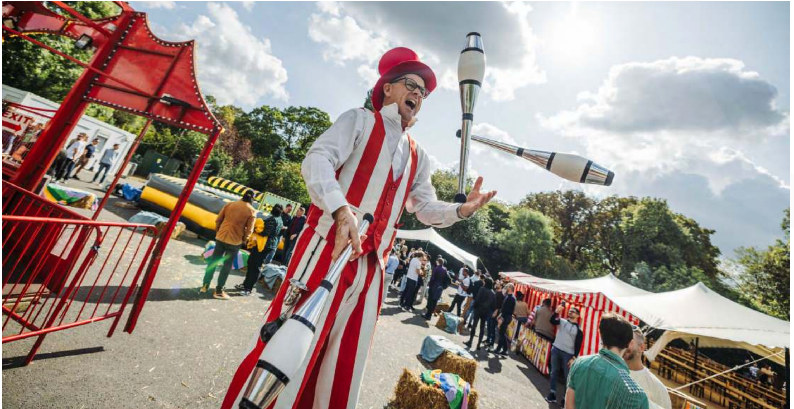
Evolution London, Battersea Park