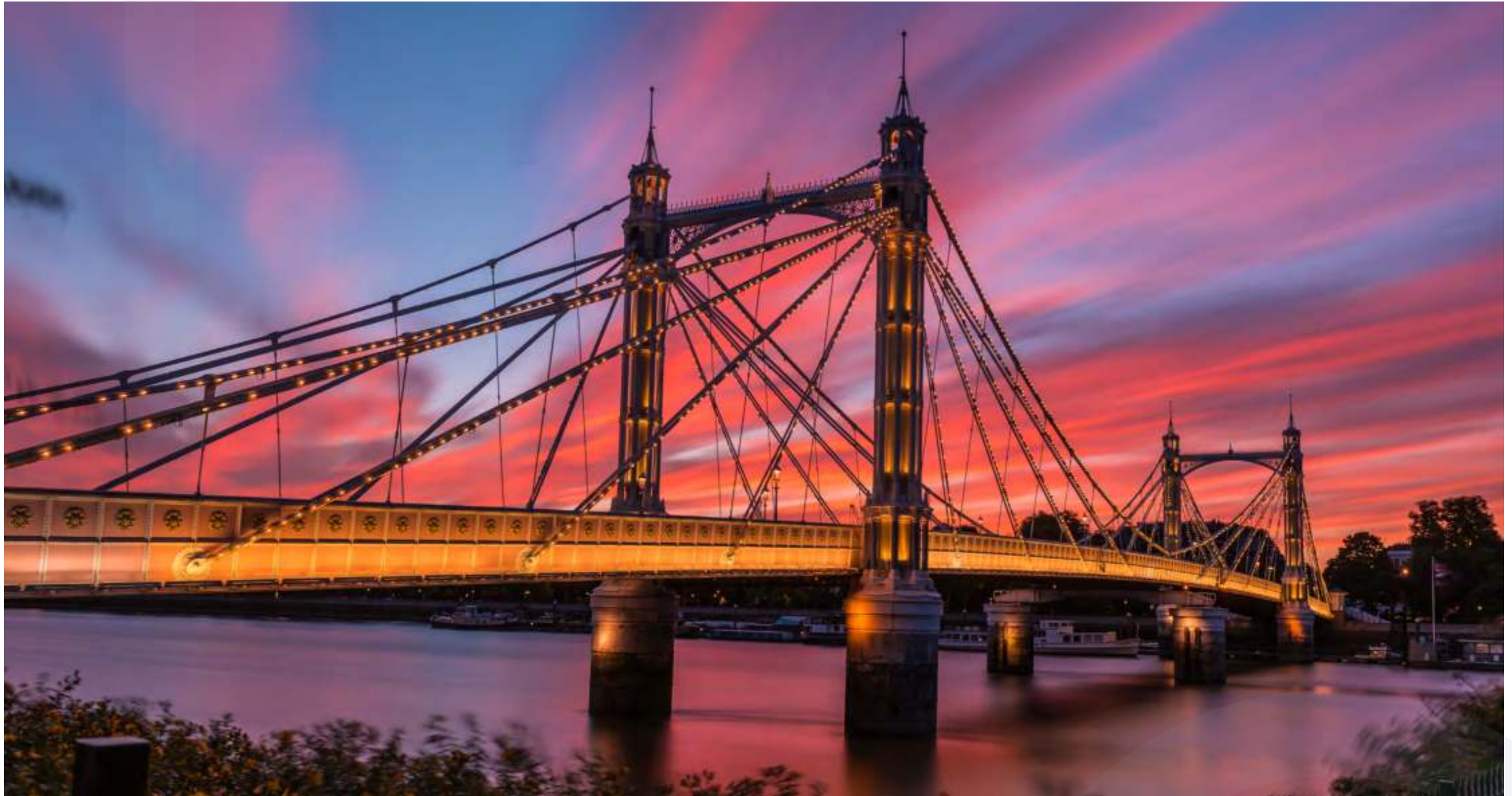
Albert Bridge, South West London