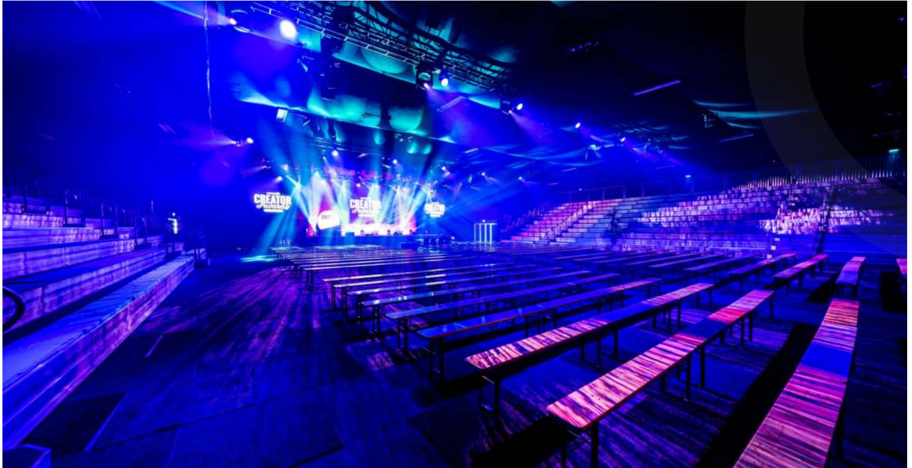
Main Space, Evolution London