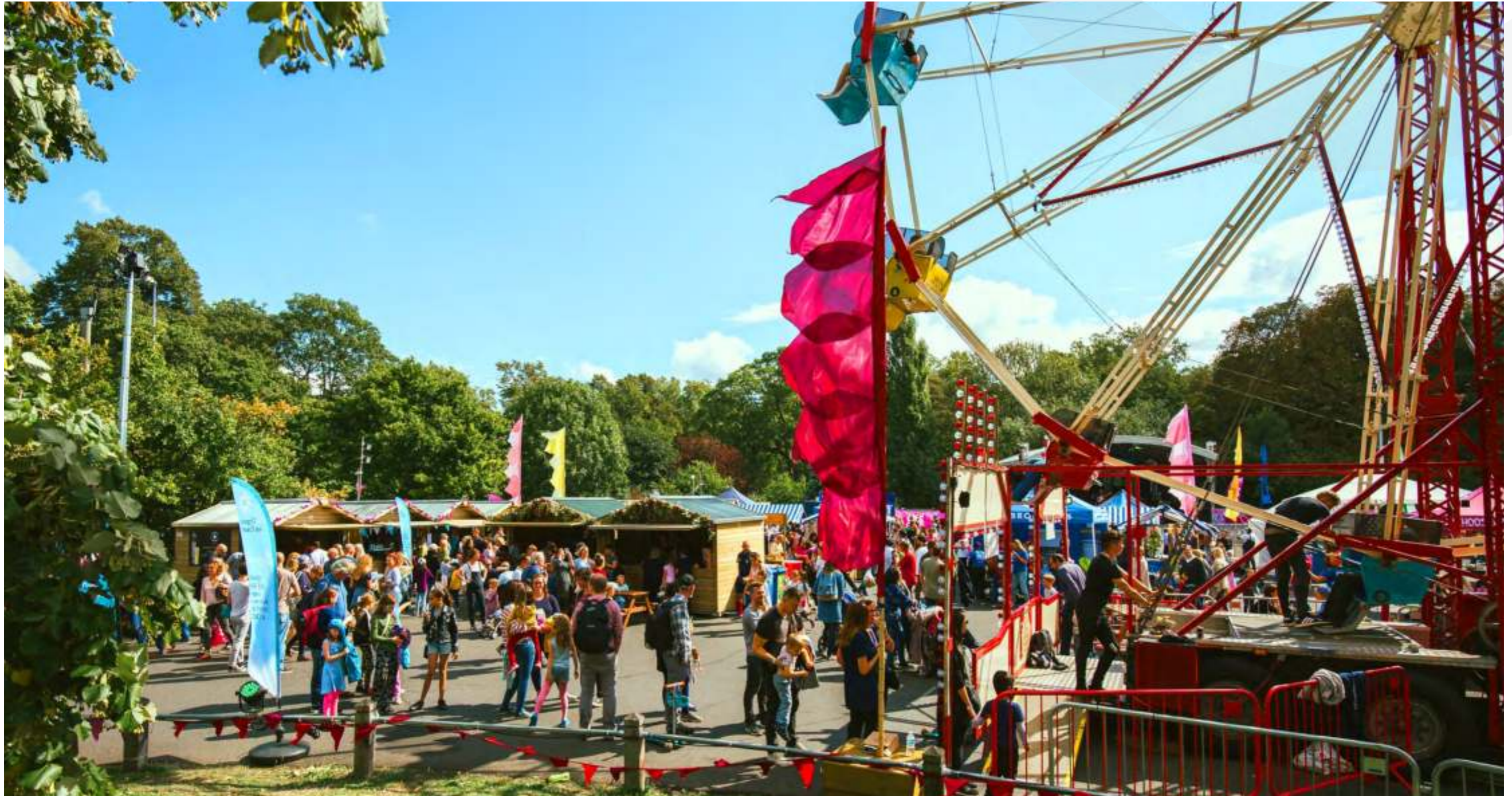
The Courtyard, Evolution London, South West London