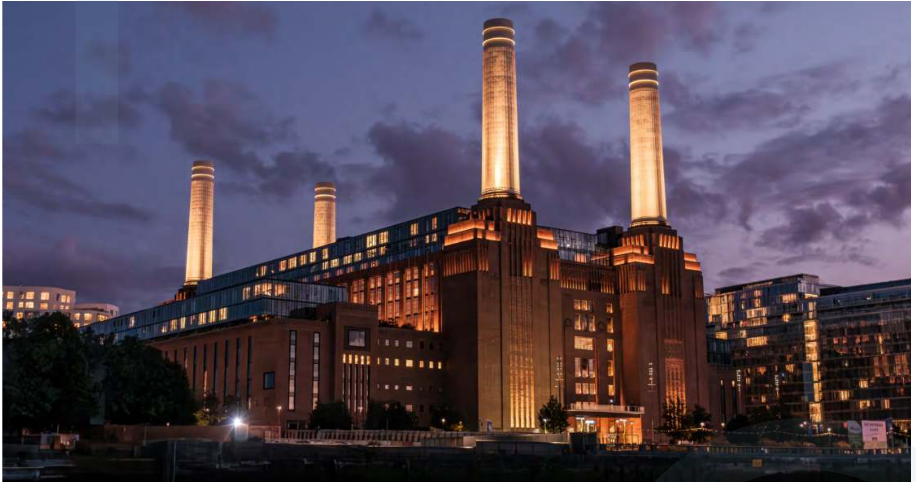
Battersea Power Station, South West London