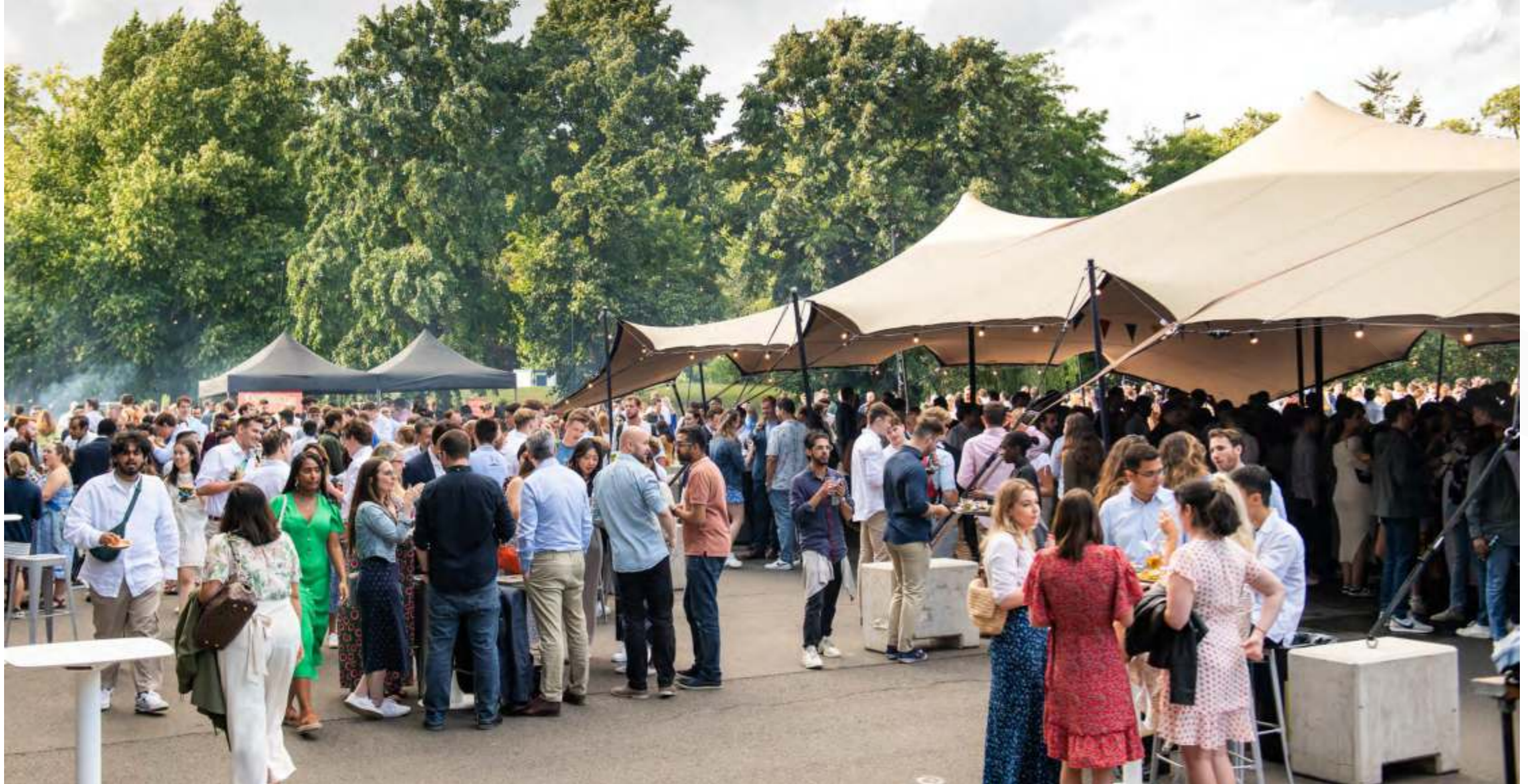
Evolution London, Battersea Park