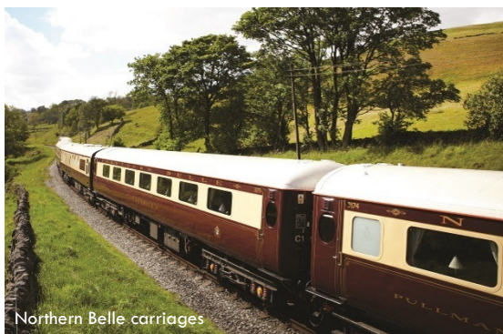
Northern Belle carriages