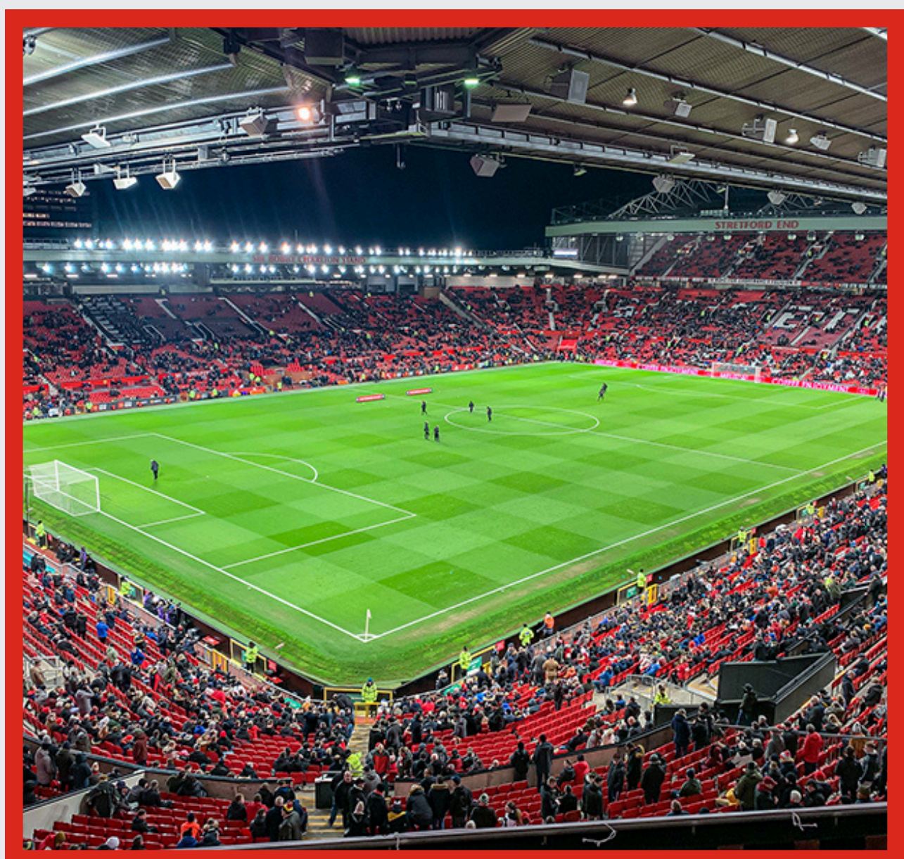
View from seat