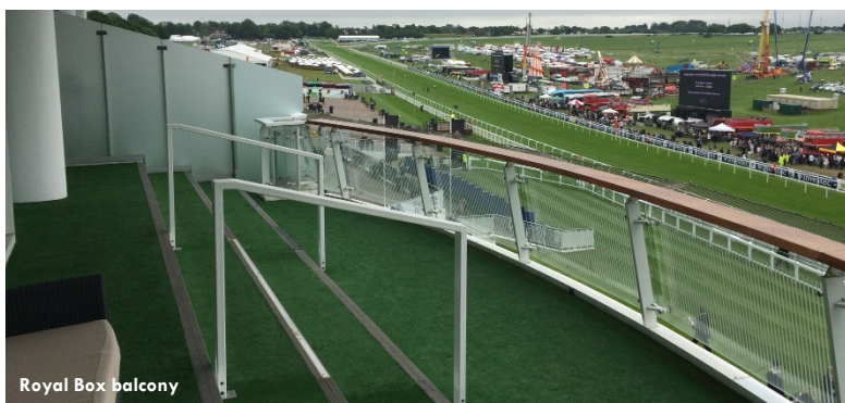
Royal Box balcony

+44 (0) 208 468 7599 | +44 (0) 771 039 9408 | liz@emgevents.co.uk | 17 The Fairway | Bromley | Kent | BR1 2JZ