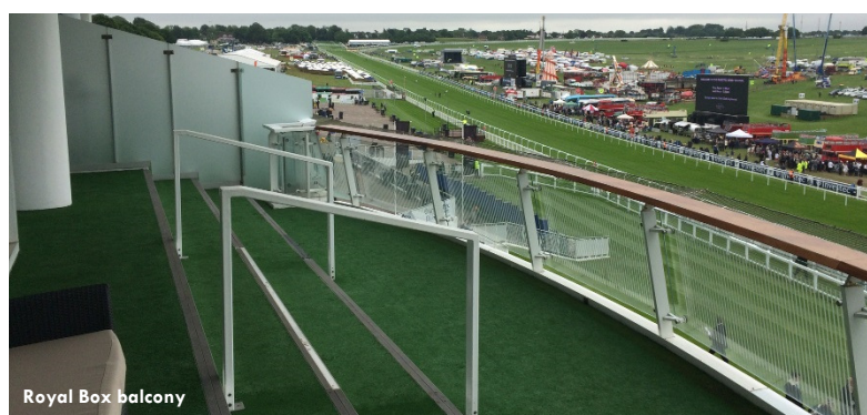
Royal Box balcony