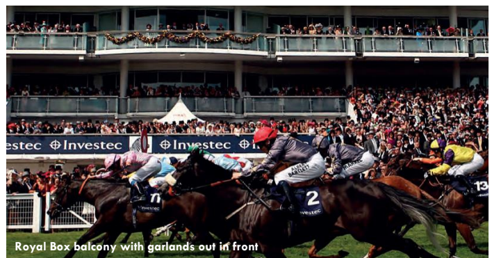
Royal Box balcony with garlands out in front