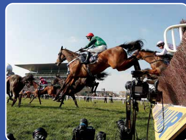
LIVE BIG SCREEN GOLD CUP RACING