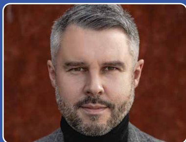
HOSTED BY PETE GRAVES (SKY SPORTS)