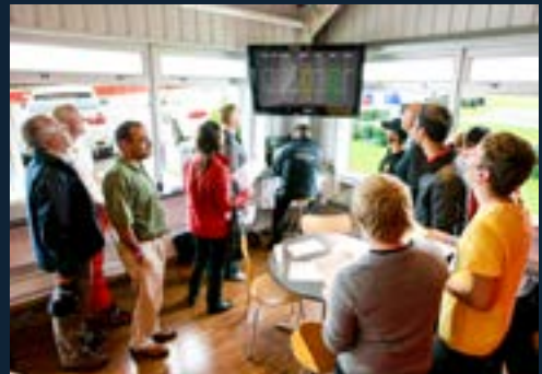
Live timing on all activities