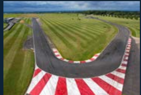
The best place in the world to drive fast cars really fast!

We're centrally located in England – just 50 miles north of London.