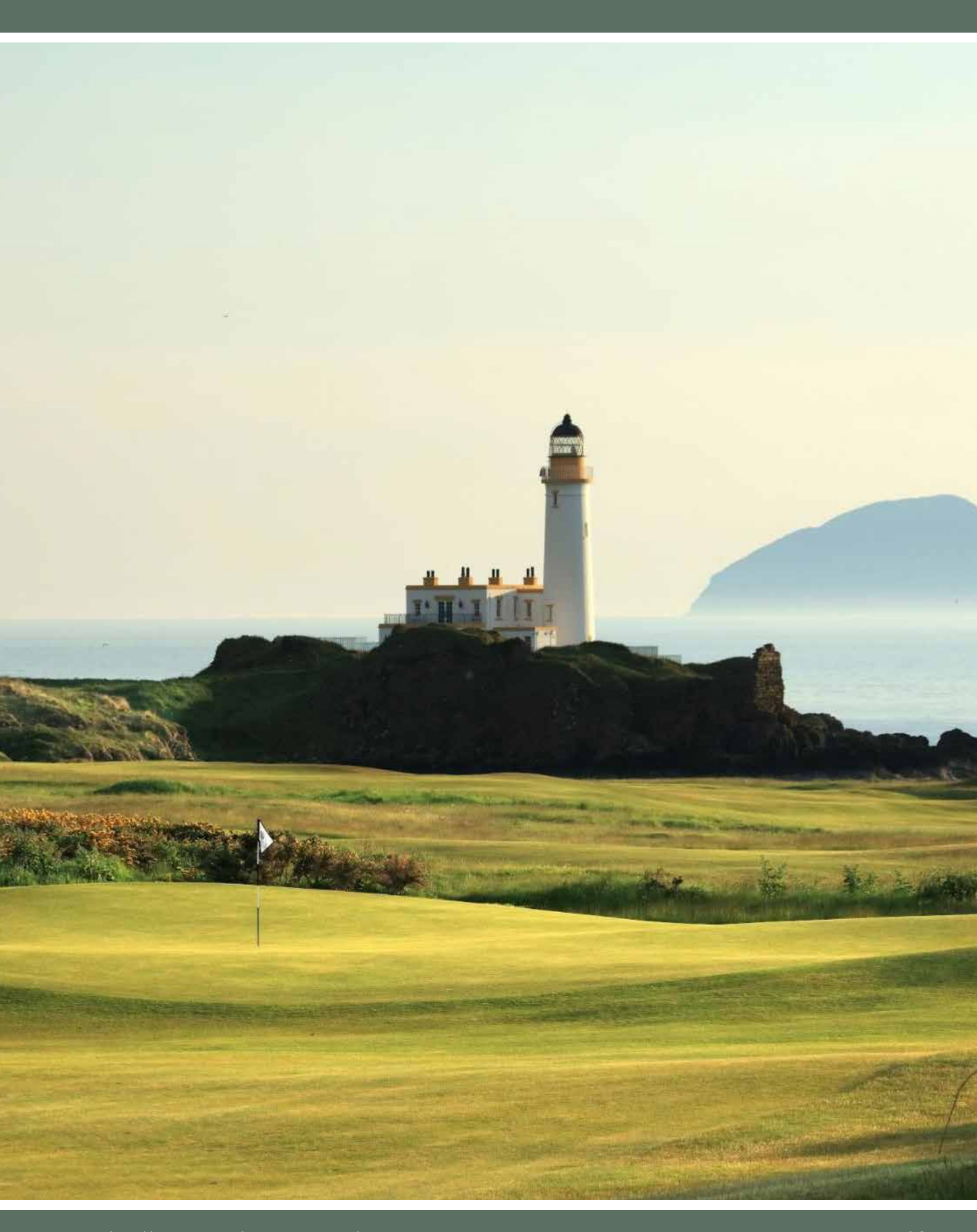
Football • Rugby • Cricket • Horse Racing • Boxing • Tennis • Golf Motor Racing • Sporting Dinners • Music Concerts • Theatre • Film