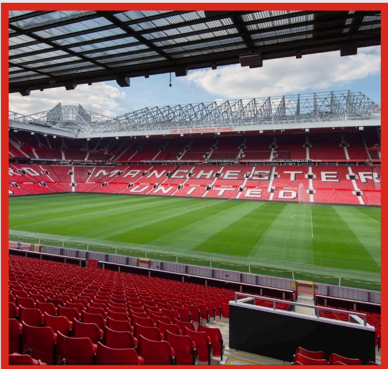
View from seat