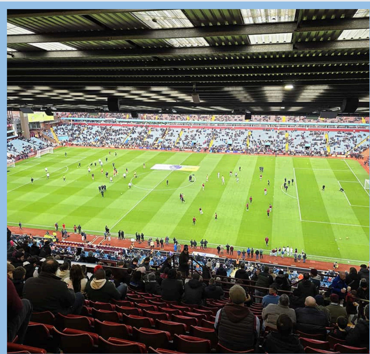
View from seat